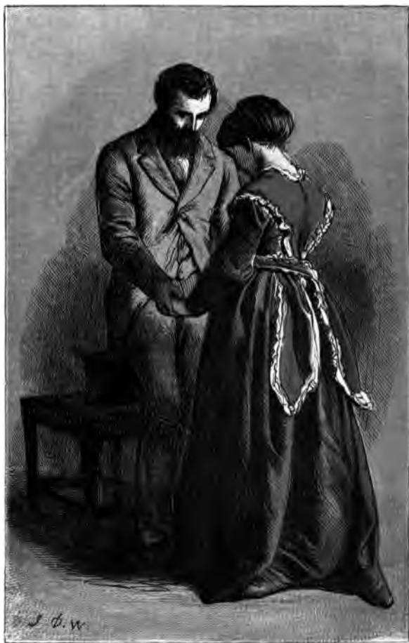
"I ran after him into the hall, my eyes full of tears, holding out both hands, which he took in both his."—Page 76.